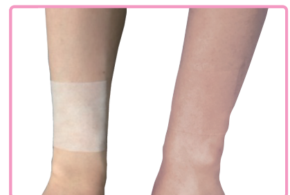
Regular Rayon 100% / BENI-TSUBAKI 100%

* Blended test in human skin The left image : Regular Rayon 100% The right image : BENI-TSUBAKI 100%